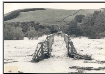
Ettrick Water (1977)