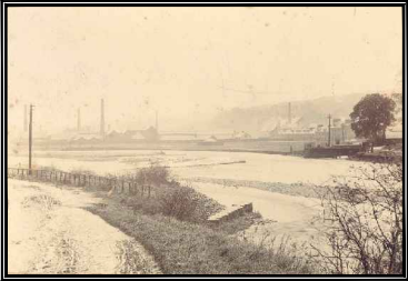
Selkirk Cauld (1898) (following a flood event)