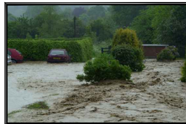
Philiphaugh Farm Cottages (2003) (during a flood event)