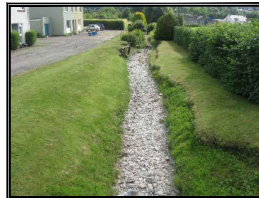
Philiphaugh Farm Cottages (June 2009) (no flow)