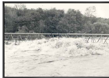
Ettrick Water (1977)