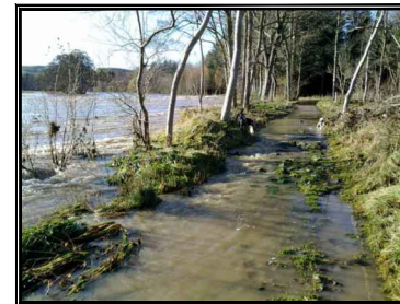
Ettrick Water near Murray's Cauld (Nov 2009) (during high flows)