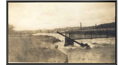
Ettrick Water (1932) (significant erosion during a flood event)