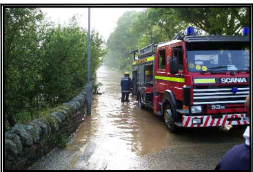
A708 Moffat Road (2003/4)