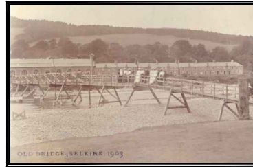
Old Bannerfield Pedestrian Bridge (1903)