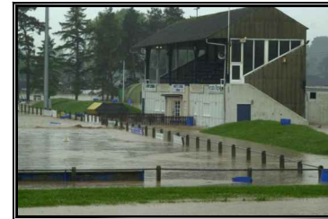
Rugby Club (2003)