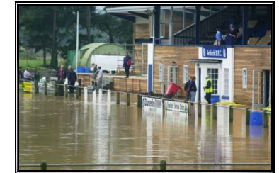
Rugby Club (2004)