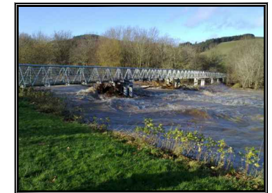
Ettrick Water (Nov 2009) (during high flows)