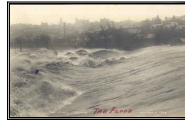
Selkirk Cauld (1926) (removed just before bridge collapsed in 1977)