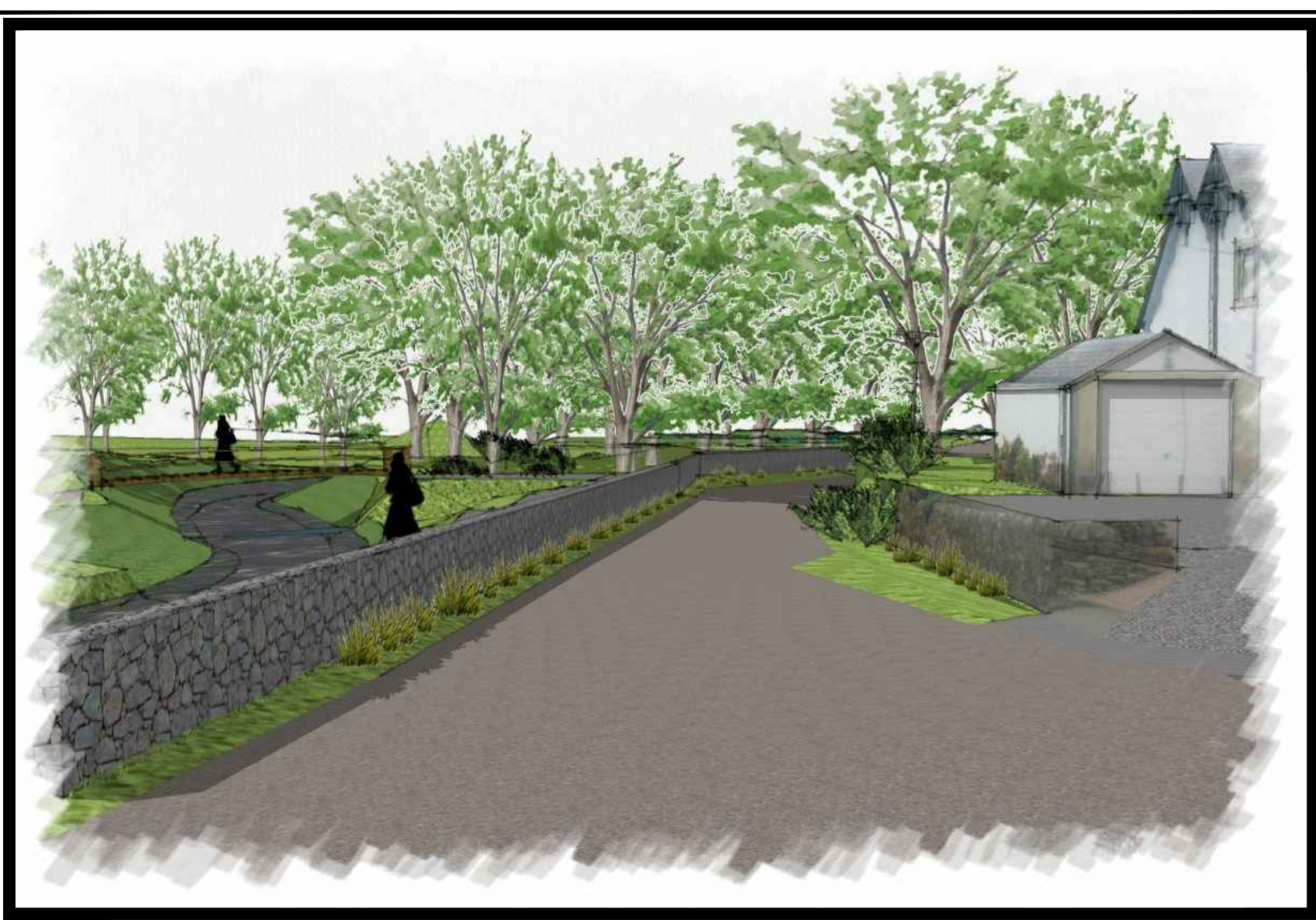
Artist's Impression No.1

This map is reproduced from Ordnance Survey material by Halcrow on behalf of Scottish Borders Council with the permission of the Controller of Her Majesty's Stationery Office. © Crown copyright. Unauthorised reproduction infringes Crown copyright and may lead to prosecution or civil proceedings. Licence Number: 100023423